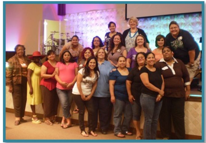
The ladies who attended Freedom Rains say they will never forget their healing experience.

Church for hosting the event at their facilities. SCARS support groups have been helping women of all ages, races, and economic status to overcome the trauma of childhood sexual abuse for years. The 2011 Freedom Rains Retreat, however, was the first opportunity for all of the group's participants to participate in a reunion, one offering a chance to fully experience the incredible love of God. It was truly a time of healing for all.