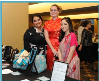
Interns from TAMUCC & Volunteers helped with the silent auction in 2011.

You don't want to miss this truly spectacular event!