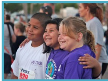
Students from Metro Elementary School of Design participated in the 1 mile fun run for children.

Family Outreach would like to thank all those that donated their expertise, time, and money to make this event successful. We couldn't have done it without your help. We are looking forward to seeing many more families join us next year in our fight against generational abuse.