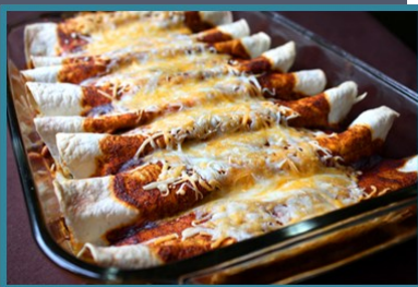
Just one of the meals prepared by volunteers for parents and children.

EDITED AND PUBLISHED BY FAMILY OUTREACH CORPUS CHRISTI, INC.