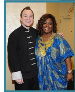
FOCC counselors in cultural attire.